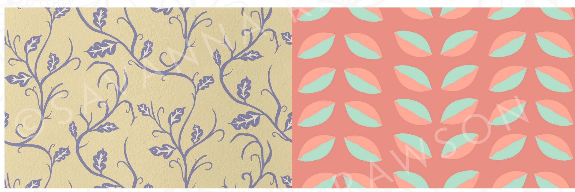
Vines - Fusia

Lilly craft is a floral collection inspired by the untamed folliage that is left to blossom and rewild the surrounding area. This is a modern take on the arts and crafts movement with a touch of whimsey and rusticity. This colourway is called Natural.