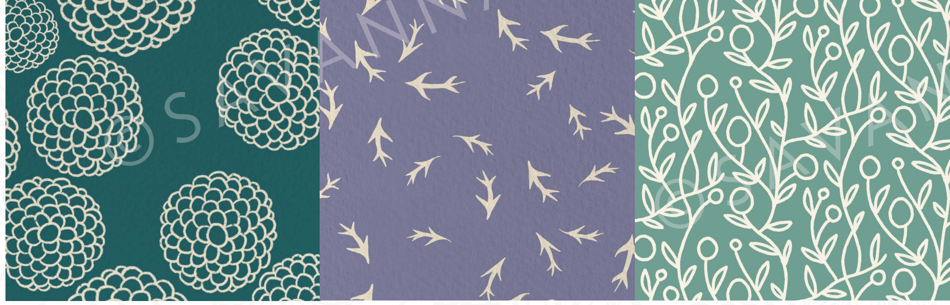
Feather Vein - Dark Mustard Vines - Mint Lilly craft - Natural