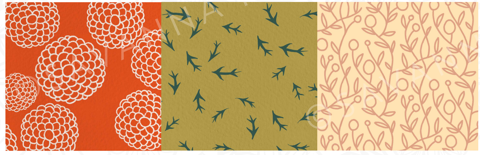
Pom Poms - Tangerine