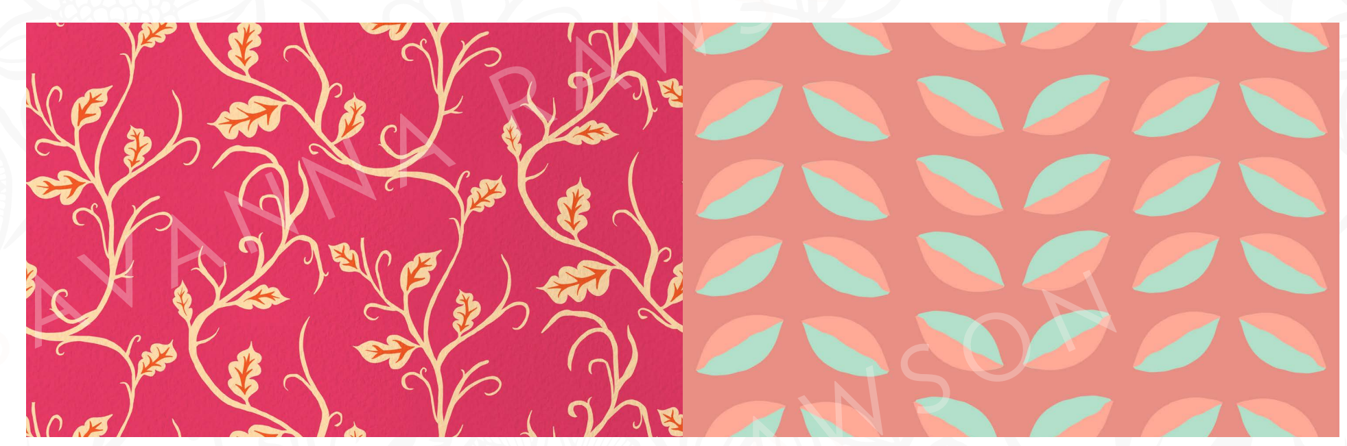
Vines - Fusia

Lilly craft is a floral collection inspired by the untamed folliage that is left to blossom and rewild the surrounding area. This is a modern take on the arts and crafts movement with a touch of whimsey and rusticity. This colourway is called Chilli.