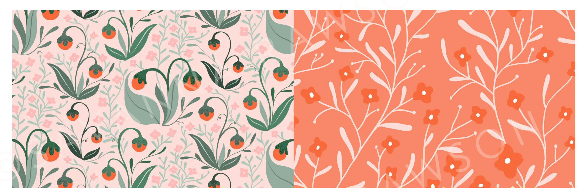
Little Red Rouge Drop

Poppy Queen is vibrant collection inspired by poppies and the fauvism art movement characterised by expressive shapes, curves and boldness.